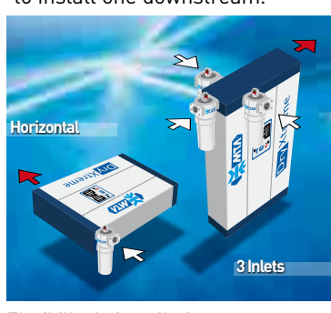
Flexibility in installation

The compact housing can be installed vertically or horizontally. NA012-107 can be wall mounted and offer 3 inlet and outlet ports which can even be inverted. The silencer allows installation near operating personnel, with an internal 1 micron post-filter eliminating the need to install one downstream.