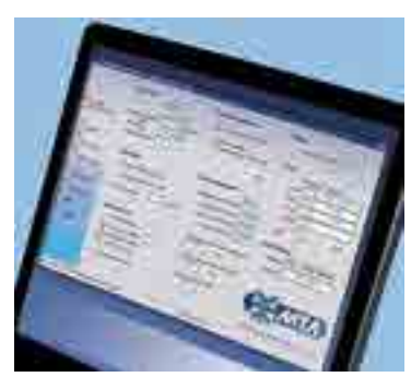
Remote supervision software