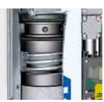
Integral post-filter & spring load

The dessicant cartridge, with integrated post-filter, allows simple, quick and clean servicing. The spring loading ensures perfect dessicant packing and eliminates attrition. The seethrough cartridge housing allows verification as to correct dryer operation.