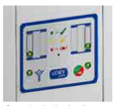
Comprehensive User interface

The reliable controller manages and monitors dyer operation, and supplies the User with updated information as to unit operation, maintenance needs, warnings and alarms.