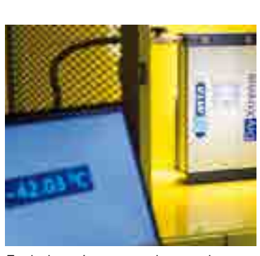
Each dryer is accurately tested

DryXtreme is born from over 30 years drying experience within MTA, with each and every dryer being quality tested and performance tested before leaving the factory. The advanced yet reliable design ensures guaranteed high performance in all conditions and applications.