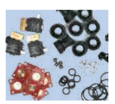
Easy to use service kits

The controller warns as to when servicing is needed, with just 2 kits covering all servicing needs, simplifying logistics. The easily removable front panel, ability to service the unit without disturbing the pipework and simple dessicant cartridge substitution allow rapid servicing.