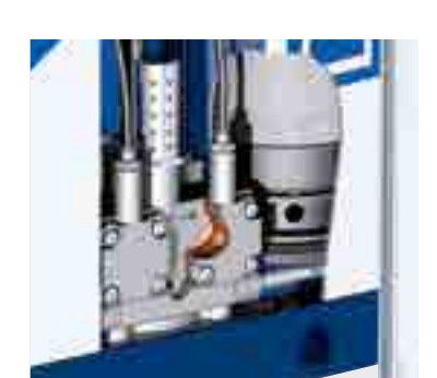
Reliable valve block

The controller ensures trouble free operation.