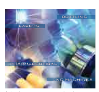
Suited to numerous applications

DryXtreme is CE marked and PED approved, as well as being ASME exempt. The ability to operate at 50/60Hz AC and DC voltages, the choice of -40 °C and -70 °C dew points and flexible pre-filter options ensure DryXtreme covers all individual needs.